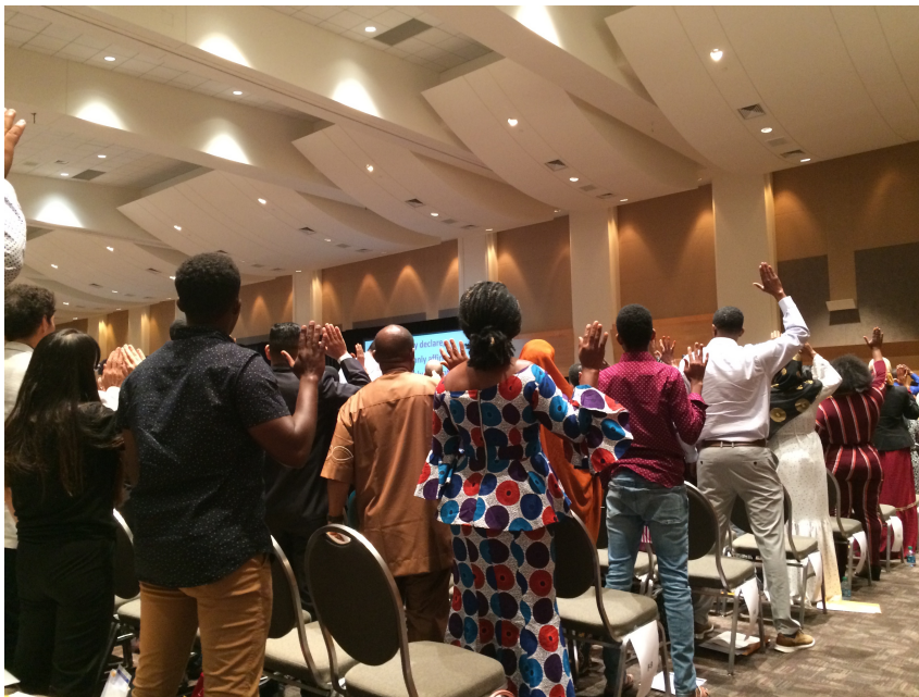
Citizenship Ceremony at St. Paul’s RiverCentre.

Here are some photos from ceremonies I have attended. Details about dates, times and whom to contact are on the following page.