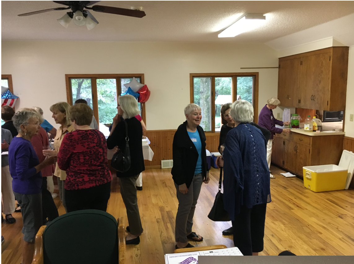
Many members gathering at the picnic.